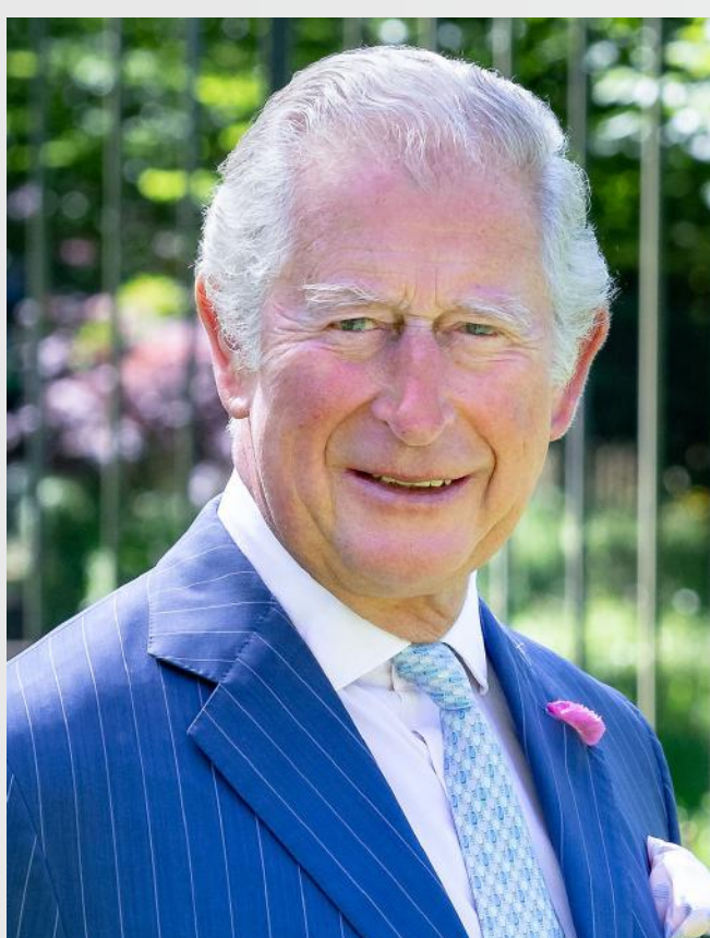
UCEM Patron His Royal Highness, The Prince of Wales